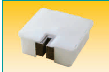
Guide rail lubricator II