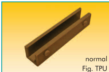
normal Fig. TPU