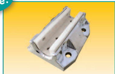
Guide holder including cell insert