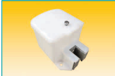
Guide rail lubricator I