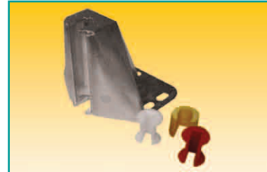
Guide holder with equipment