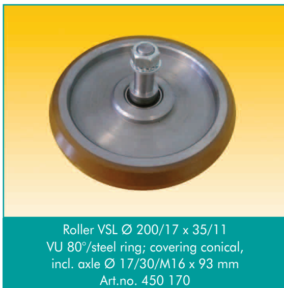
Roller VSL Ø 200/17 x 35/11 VU 80°/steel ring; covering conical, incl. axle Ø 17/30/M16 x 93 mm Art.no. 450 170