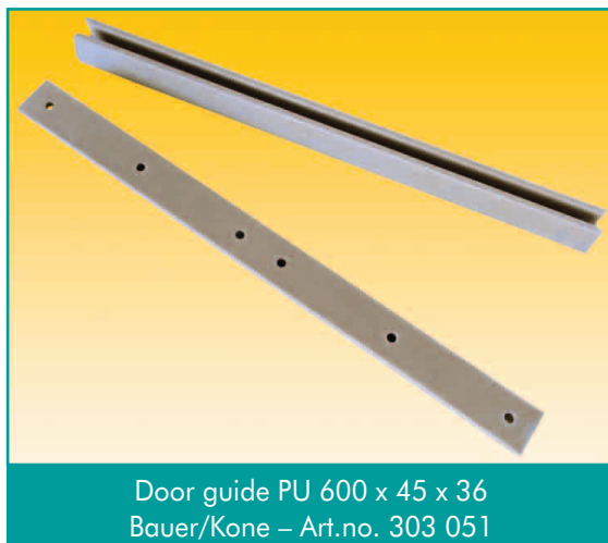
Door guide PU 600 x 45 x 36 Bauer/Kone – Art.no. 303 051