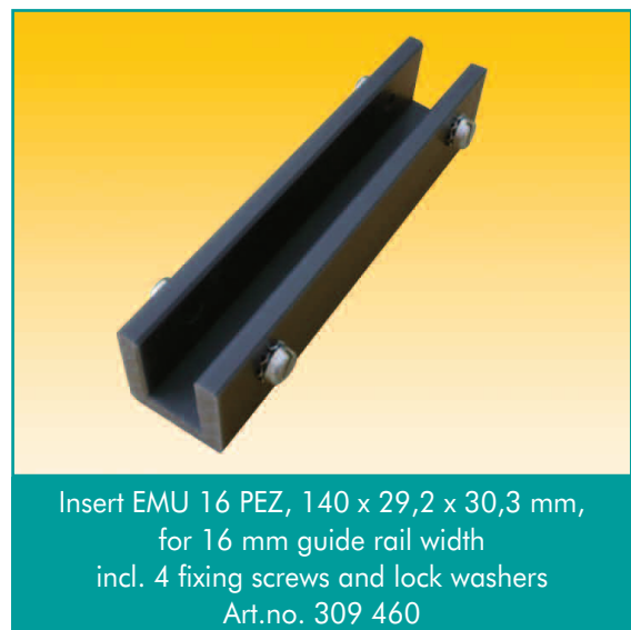
Insert EMU 16 PEZ, 140 x 29,2 x 30,3 mm, for 16 mm guide rail width incl. 4 fixing screws and lock washers Art.no. 309 460